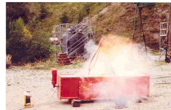
Already in the 70th and 80th bucket conveyor components were tested.

So it is possible to use the bucket conveyors in dust explosive zones 20 -22 considering the minimal ignition energy and temperature.