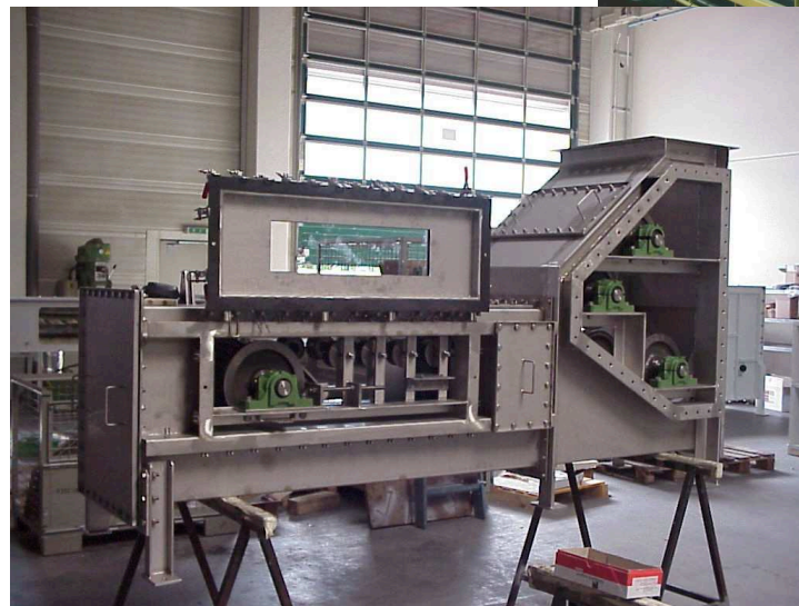
Samples for gastight design